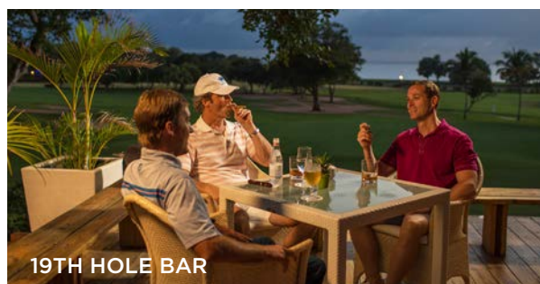
19TH HOLE BAR